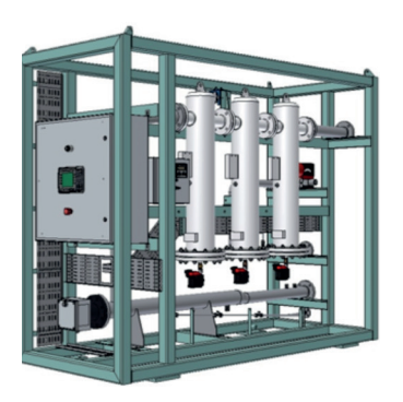
Filter and Control skid