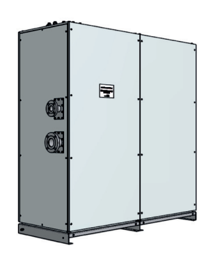
Membrane separator banks