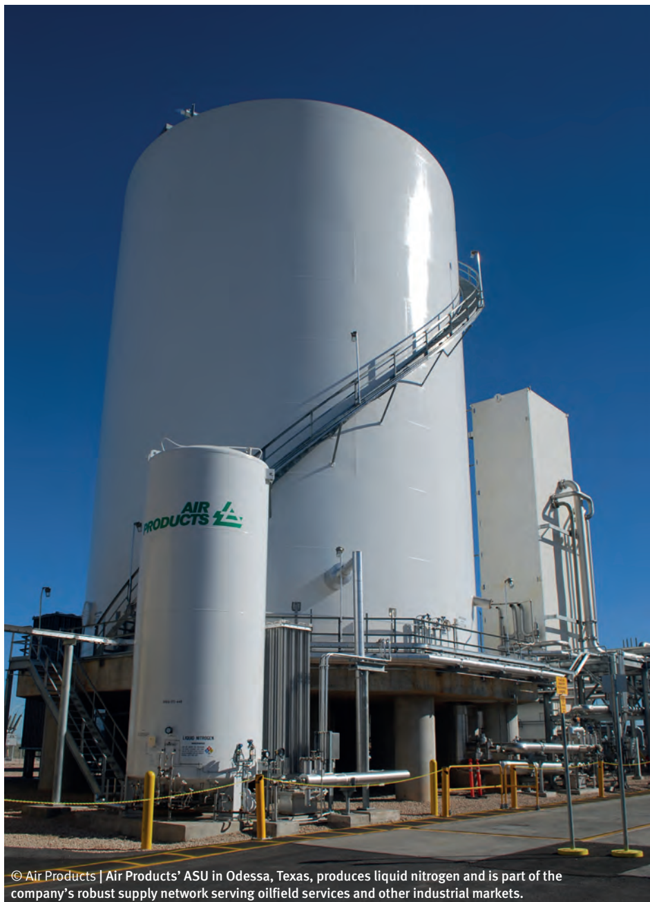
Air Products' ASU in Odessa, Texas, produces liquid nitrogen and is part of the company's robust supply network serving oilfield services and other industrial markets.

A new trend in gas supply to the semiconductor industry has recently emerged due to an increase in high-purity argon requirements to support growth in pure silicon crystal manufacture. Air Products stayed ahead of this curve by proactively developing a world-scale TN LAR air separation plant design, which uses a proprietary purification technology integrated with the air-drying system to deliver ultra-high purity nitrogen and argon. The TN LAR plant features a proprietary new distillation column packing that is 15% more efficient than previous standards. It also employs the