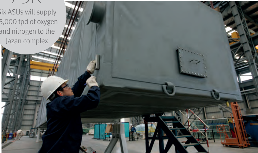
Air Products produces equipment used in its industrial gases business at manufacturing facilities in Caojing, Shanghai, China (above) and Port Manatee, Florida, US.

In 2019, Air Products reached mechanical completion of the world's largest industrial gas complex in Jazan, Saudi Arabia. Six air separation units will supply over 75,000 tpd of oxygen and nitrogen to an integrated gasification and combined cycle (IGCC) complex. These mega plants are specially designed with the latest technology to safely and reliably supply the IGCC complex with oxygen for gasification and nitrogen as diluent for the combined cycle units. At peak construction, there were 6,000 people at