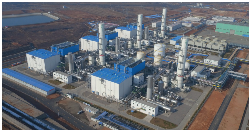
Air Products built four large ASUs capable of supplying over 10,000 tons per day (tpd) of oxygen, over 6,000 tpd of nitrogen, and over 700 tpd of instrument air for its joint venture coal gasification project with Lu'an Clean Energy, now on stream in Changzhi, China.

As the world strives for a more sustainable future, Air Products is pushing the boundaries of air separation technology to meet this challenge through innovation. When the Netherlands faced a matter of national energy importance, N.V. Nederlandse Gasunie turned to Air Products to supply three specialized nitrogen generator units. On-stream in 2021, the 180,000 Nm 3 /h of nitrogen from these plants will be used to condition imported natural gas, replacing domestic gas production supplied from its Groningen field.