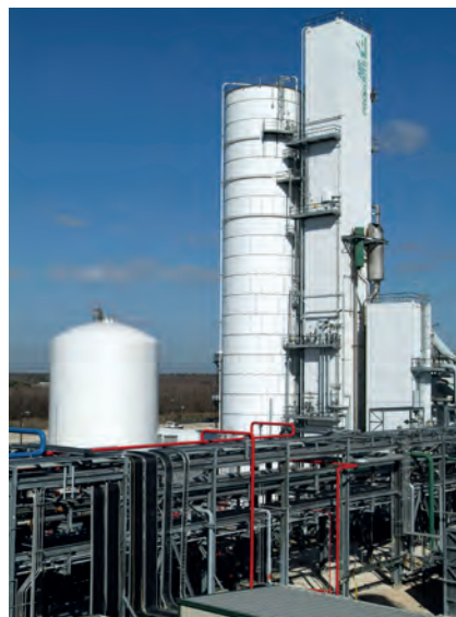
Air Products' ASU in Baytown, Texas, produces merchant liquid nitrogen, oxygen and argon supplying a multitude of industry segments by truck and railcar, along with gaseous oxygen and nitrogen supplied by pipeline to local refinery and petrochemical facilities in the Houston ship channel area.

“This is absolutely essential to meeting the world's ever-growing demand for energy and sustainability.” sw