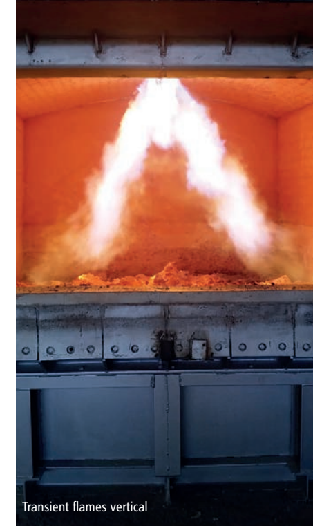
Transient flames vertical