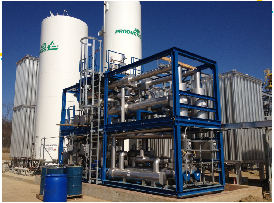
A 150 SCFM (standard cubic foot per minute) Cryo-Condap installation with redundant low temperature condensers.