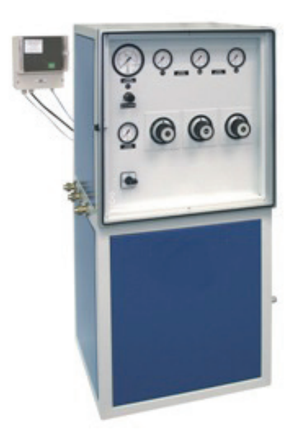
Figure 1: Flow Rate in Nm<sup>3</sup>/h based on inlet pressure 13 barg

Available in four sizes – from small to extra large (as shown in fig 1.) – with many additional features, including the ability for data logging and automatic calibration with the advanced system.