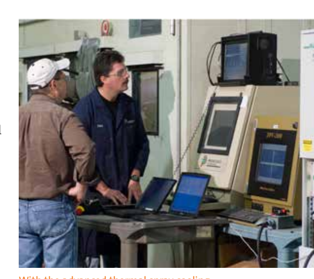
With the advanced thermal spray cooling technology system you can monitor your spray operation from the control room. The temperature profile for your operation will be displayed on your computer screen and captured for future analysis, playback and audits.

Our system can eliminate the need for traditional, rigid protective masking that must be rugged and resistant to high temperatures. With our technology, you can use inexpensive, flexible masking tapes that are easy to apply and remove, resulting in radically reduced setup and cleaning times. This is a result of cryogenic nitrogen's unique ability to cool the masking tape quickly, preventing its thermal breakdown.