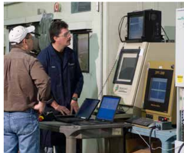
With the advanced thermal spray cooling technology system you can monitor your spray operation from the control room. The temperature profile for your operation will be displayed on your computer screen and captured for future analysis, playback and audits.

Our system can eliminate the need for traditional, rigid protective masking that must be rugged and resistant to high temperatures. With our technology, you can use inexpensive, flexible masking tapes that are easy to apply and remove, resulting in radically reduced setup and cleaning times. This is a result of cryogenic nitrogen's unique ability to cool the masking tape quickly, preventing its thermal breakdown.